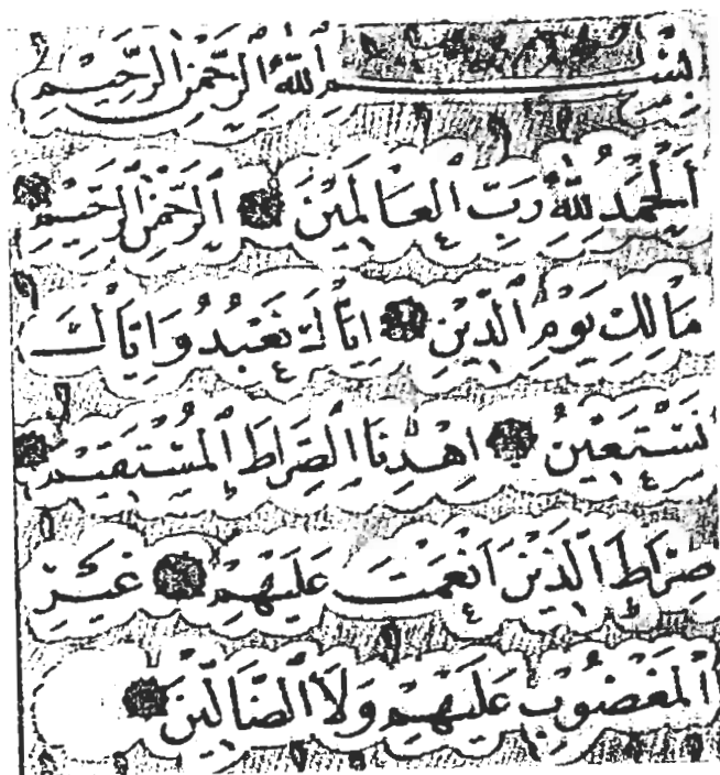
The first chapter of the Qur'án, Sūrat al-Fātiḥa, The Opening.